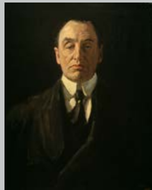
John Lavery, Sir Edward Carson MP, 1916.