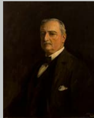
John Lavery, John E. Redmond MP , 1916. Collection Dublin City Gallery The Hugh Lane.