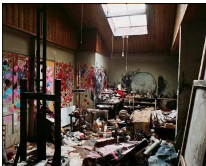
7 Reece Mews Francis Bacon Studio.

Can you find the wooden stairs that is inset into the ground of the studio complex? It is the original stairs from 7 Reece Mews. How does it feel hovering over the stairs? Can you imagine Bacon ascending the stairs, to enter the studio and his living quarters that were located on the first floor of the mews? What do you think is the significance of visualising this journey?