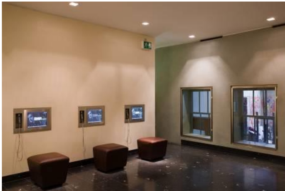
Installation view of the touch screen terminals in the Francis Bacon Studio complex.

The Micro Gallery, which comprises of seven interactive digital screens, gives the viewer the opportunity of exploring the studio in more detail. Each terminal acts as a comprehensive visual archive that contains an edited version of the Francis Bacon database that the gallery has compiled. The database was created 'to highlight the