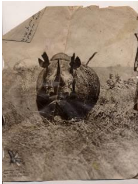
Photograph of Rhinoceros by Peter Beard found in Francis Bacon's studio. Collection: Dublin City Gallery The Hugh Lane. ©The Estate of Francis Bacon

The photographer Eadweard Muybridge, whose photographs capture the human figure in every conceivable action and activity, was another constant reference that Bacon returned to. Several copies of Muybridge's book The Human Figure in Motion and Animal Locomotion were discovered in Bacon's studio. (Dawson, 2009, p.59)