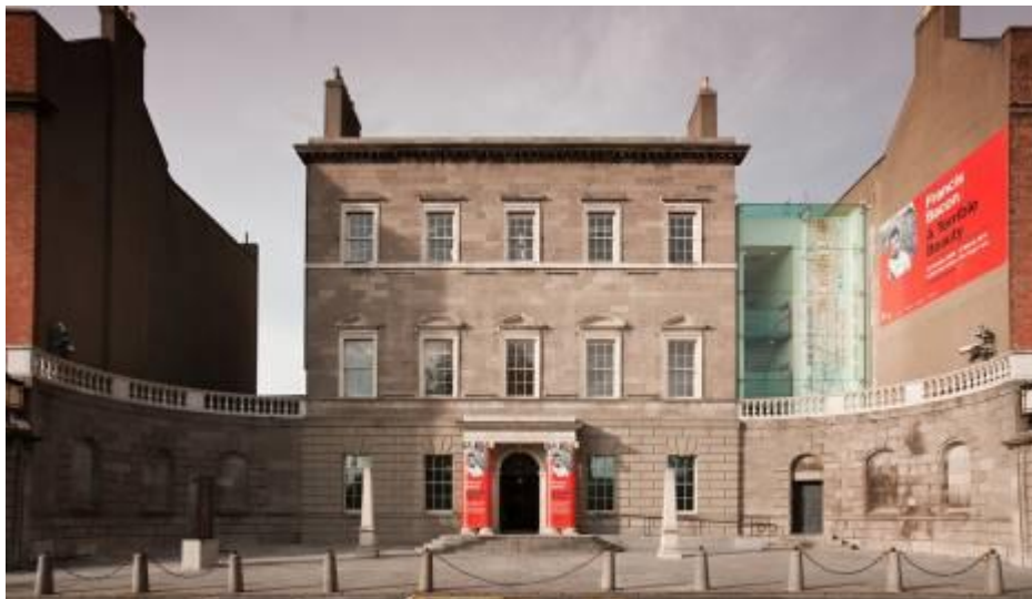
Exterior view of Dublin City Gallery The Hugh Lane

Include in your introduction to your gallery question a brief, concise overview of the name, location, function and history of the institution that is holding the exhibition. Here is some information to help you concerning Dublin City Gallery The Hugh Lane.